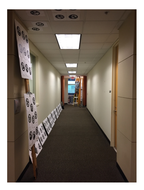
Figure 3. Indoor localization testing, using the mounted fiducials for the Intersense IS-1500 tracking system.

Figure 2. Tool developed to place sound sources in a (virtual) map of the real environment, for use in prototyping sound designs and layouts.