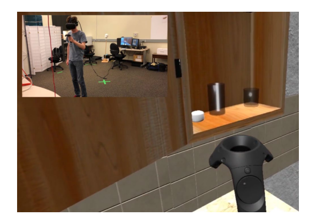
Figure 1. VR testing environment for SWAN 2.0 user interface, focusing on the "last meter" vertical location of objects.