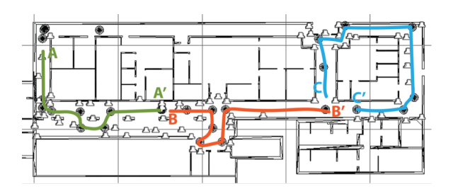
Figure 2. Tool developed to place sound sources in a (virtual) map of the real environment, for use in prototyping sound designs and layouts.

Figure 1. VR testing environment for SWAN 2.0 user interface, focusing on the "last meter" vertical location of objects.